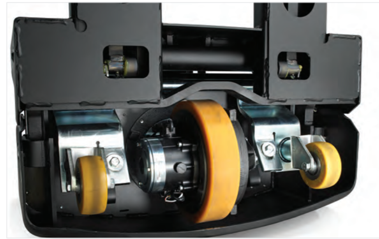
The unique Castorlink system protects castor wheels on uneven surfaces