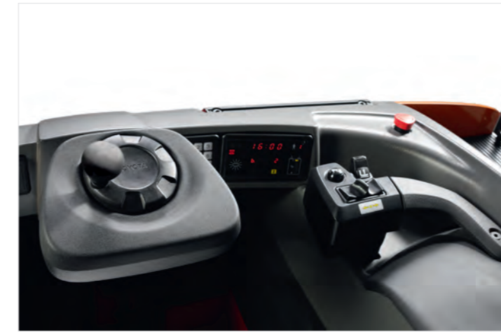
The cab and controls are fully adjustable to suit the driver