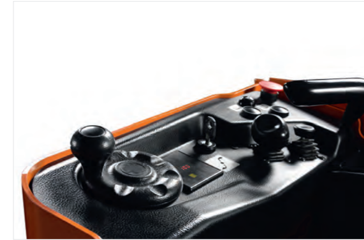
Easy driving with small electronic steering wheel