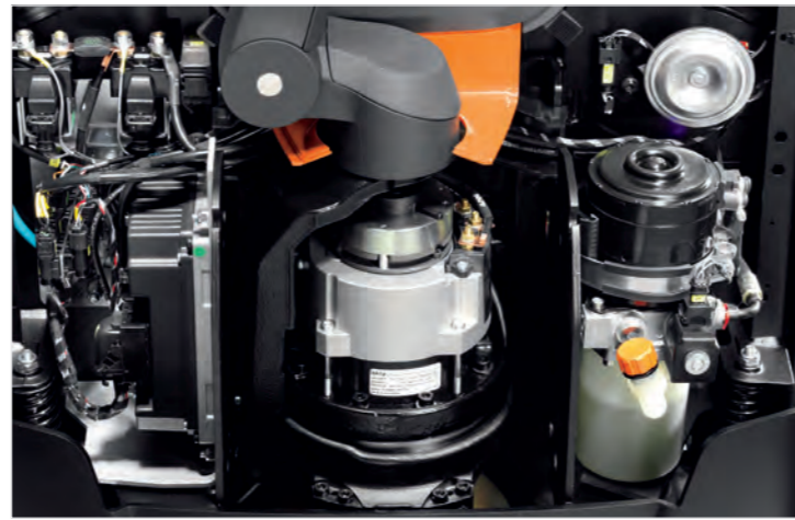
Easy access for efficient servicing