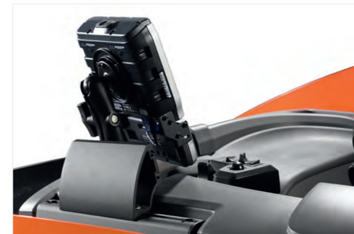
Optional E-bar for ancillary equipment