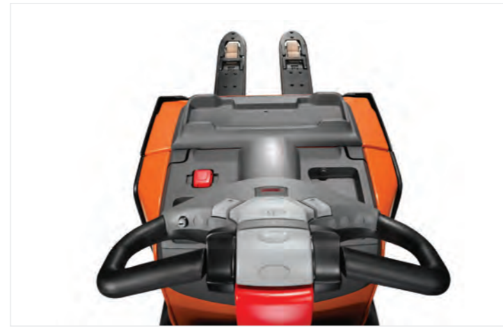
A clear view of the forks from the driving position