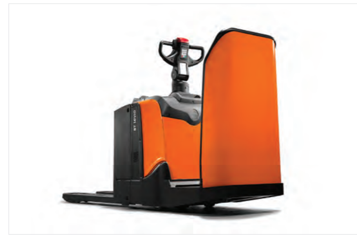
Fixed platform and backrest