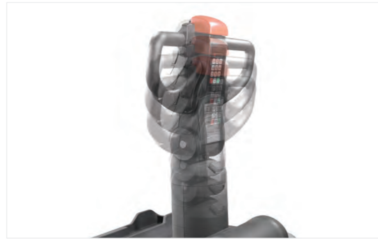
The height of the steering arm can be adjusted at the touch of a button