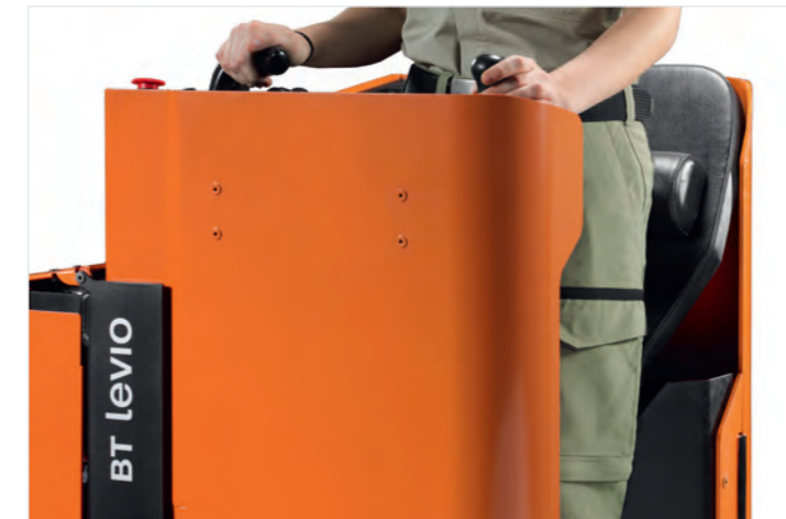
The driver is fully protected within the cab