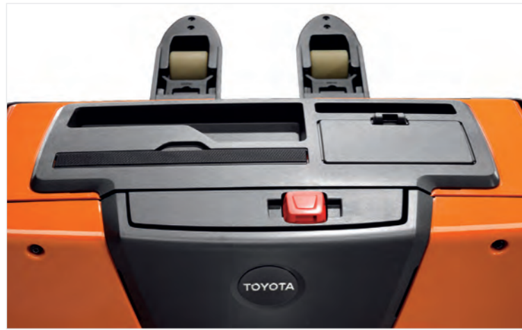
A clear and safe view of the forks