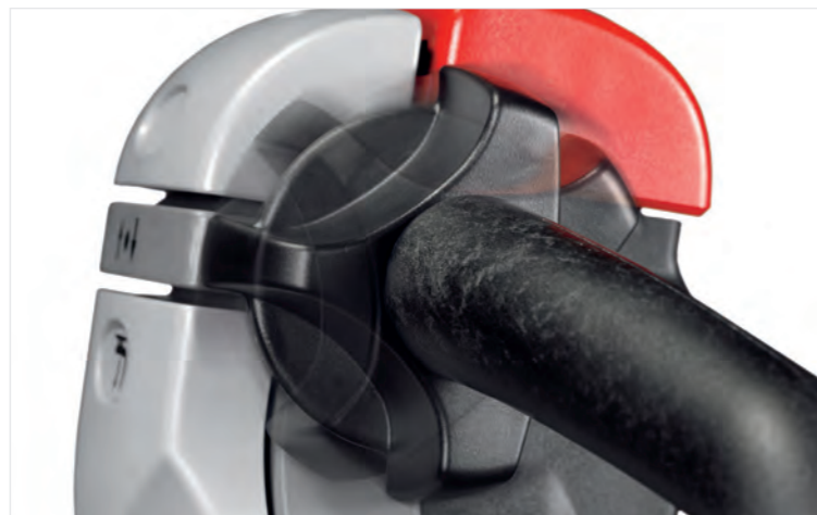
Fingertip control for drive, lift and lower with unique click-2-creep feature