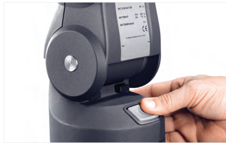
One-touch action to fold away the sideguards