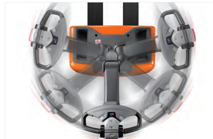
Steering arm rotation