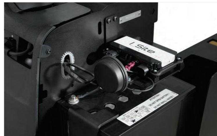
Easy access for efficient servicing