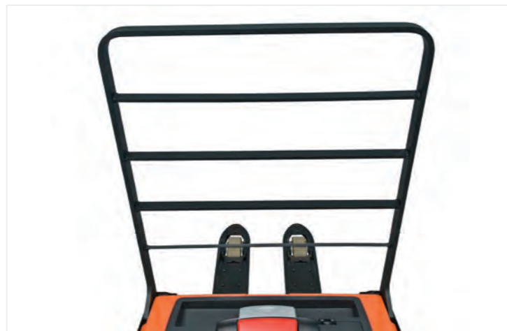
LWE load support