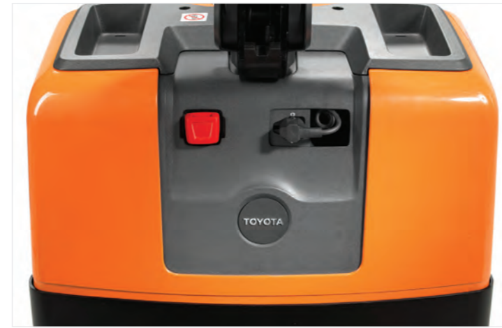
The control panel includes a pull-out power lead for the built-in battery charger