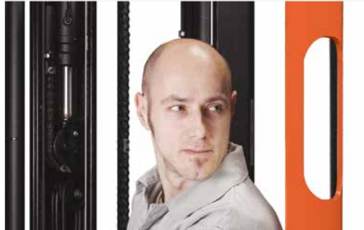
The rear pillar window aids visibility and helps the driver to stay within the truck cab, for extra safety