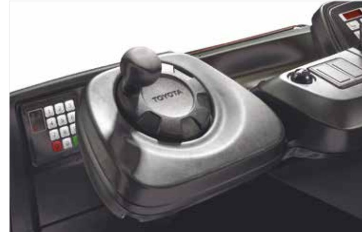
BT Reflex N-series models feature 360° steering, for intuitive and responsive control