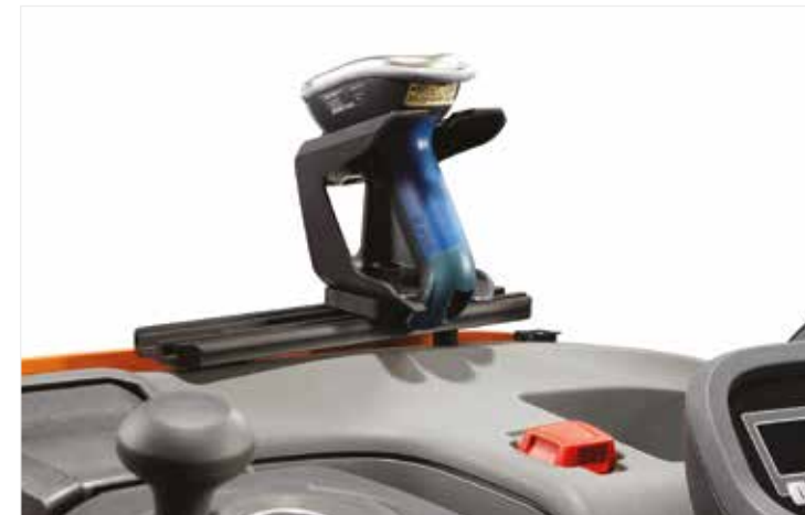
Optional E-bar mount for all ancillary equipment