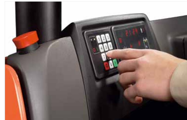
BT Access Control is standard, preventing unauthorised use