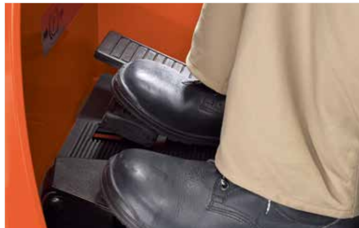
Electronic braking aids driveability