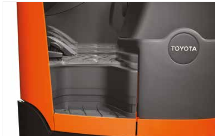
The driver compartment is adjustable to suit different driver sizes. The floor height can be adapted manually or electronically.