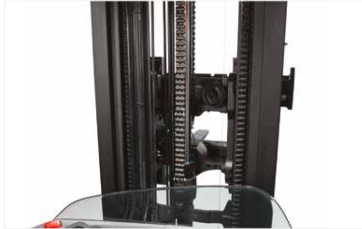
The open fork carriage with integrated side shift offers excellent visibility forward.