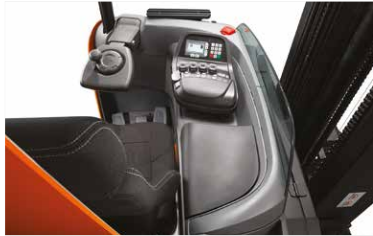
The cabin is ergonomically designed around the operator, allowing consistent productivity during a shift