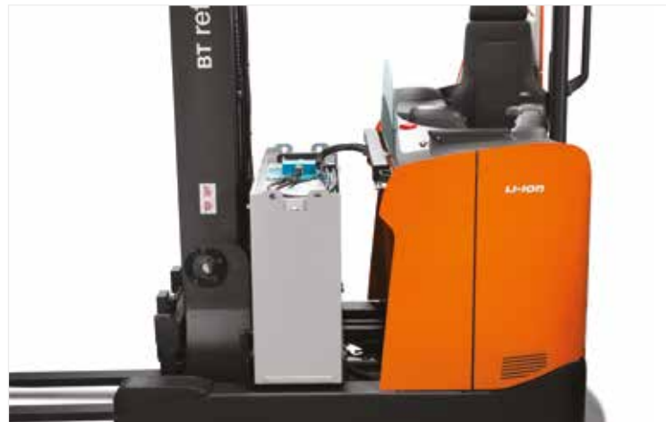
Lithium-ion batteries allow for opportunity charging and are 30% more energy-efficient than conventional batteries.