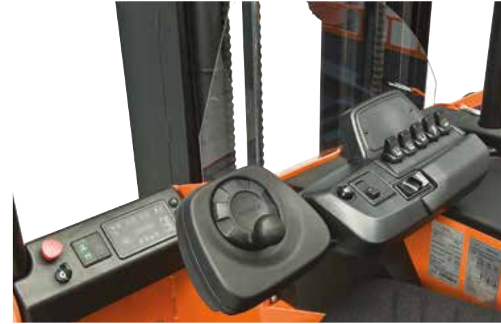
The operator faces the forks to obtain the best view of long and unusual loads