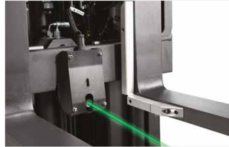
Easier positioning of the forks in front of pallets with the fork laser option reduces damage cost and keeps productivity high.