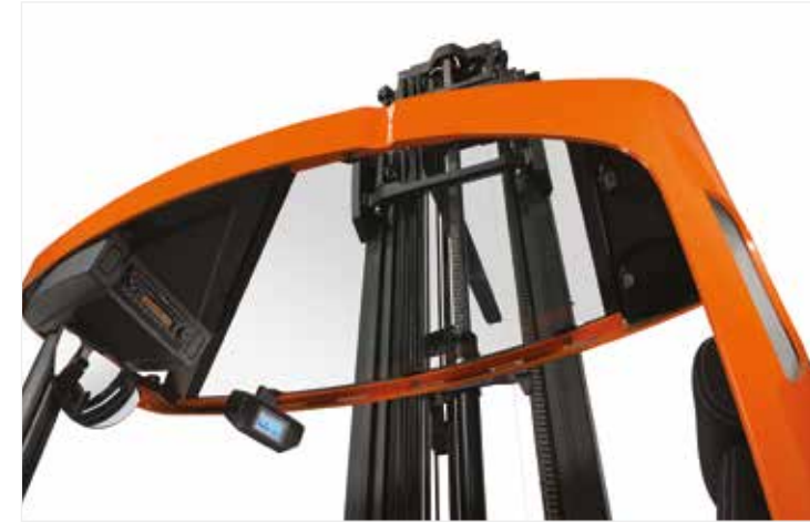
The transparent roof provides a clear upward view to the forks when working at height.