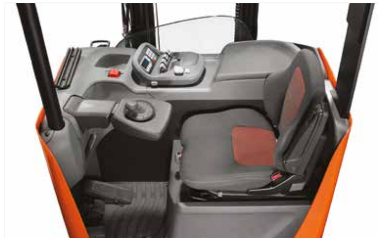
Cab designed around the driver (shows optional 'comfort' seat)