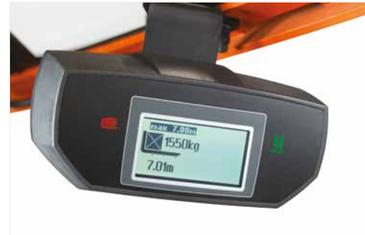
The overload warning system will warn the operator when the maximum lift height is reached for the load on the forks.