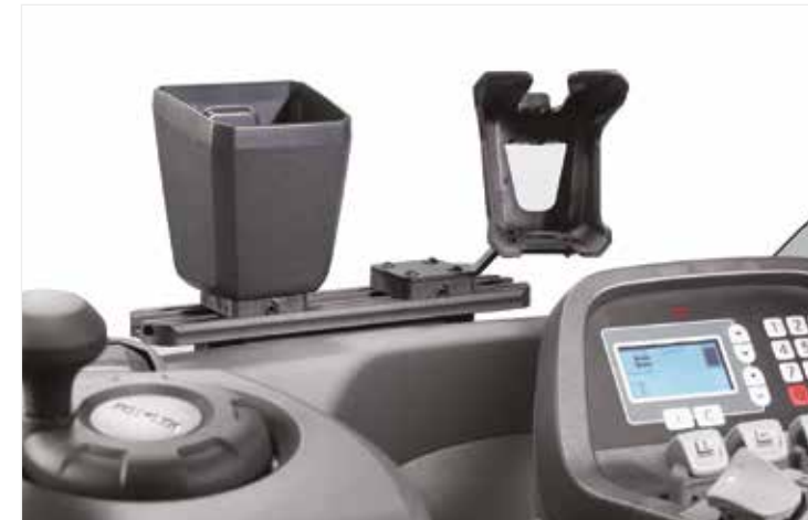
Optional E-bar mount for all ancillary equipment